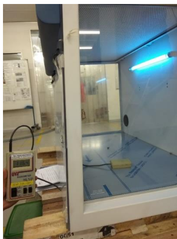
Figure 1. Initial measurement of light intensity inside the cabinet with a fitted operating UV lamp and front cover for protection of investigators.

The cabinet used for the test was an Airstream® PCR Cabinet (PCR-3A1) fitted with UV lamp and front cover. The results will reflect for both Esco LFC and PCR cabinets since they both use polycarbonate as its front cover material. Figure 1 shows measurement of light intensity inside the working area with an activated UV lamp. The value obtained was 116.4 \mu\text{W}/\text{cm}^2 .