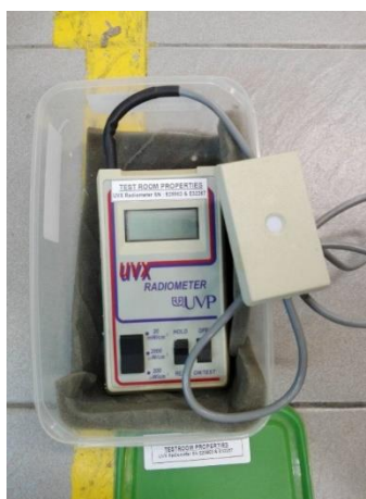
Figure 2. Radiometer used for UV measurement.