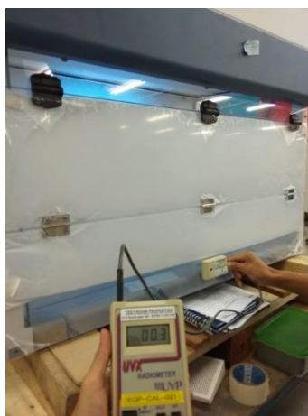
Figure 3. Measuring UV Light Intensity using Radiometer.